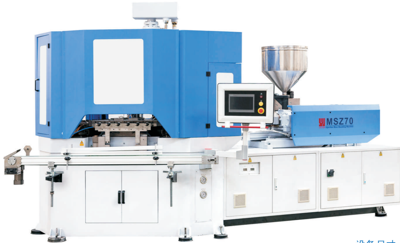
设备尺寸 Machine Dimension